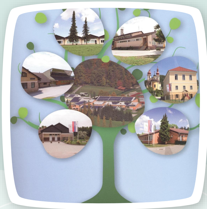
Primary School Šmarje pri Jelšah with six branches